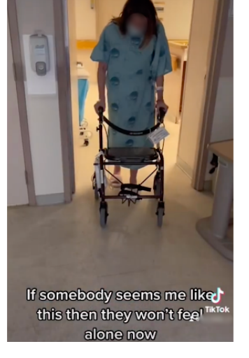
Figure 4. Evidence example of a posted reel related to theme 3.

Physical symptoms (33 quotes) cluster codes of posts about sharing physical symptoms and side effects of treatments and medical procedures. This also included posts on appreciating the capabilities of the body and addressing difficulties with trusting their body after the miscarriage: