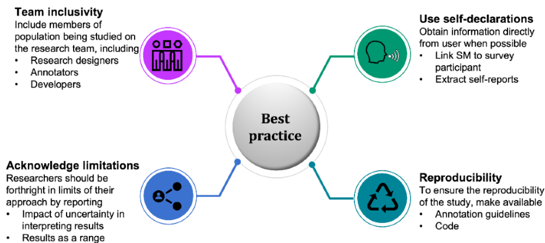
Figure 2. Summary of our best practice recommendations.

In light of our results, we have compiled our recommendations for best practice, which are summarized in Figure 2 and further examined in the Discussion section.