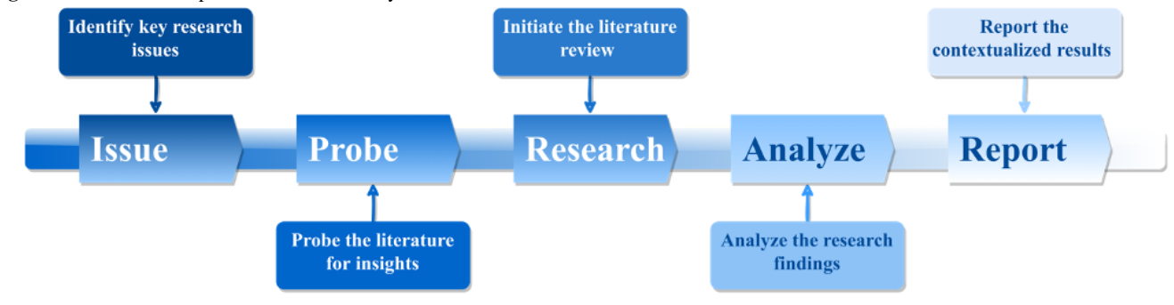
Figure 1. A schematic representation of the study framework.