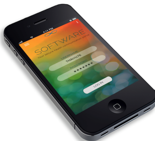
Figure 2. App design.

The second round of user testing, comprising 44 semidirected interviews, took place in 3 Paris hospitals and 1 community-based clinic in WA. An interview guide was developed. In the first part of the interview, researchers described the purpose of the application and asked the patients (n=28) and doctors (n=16) about their computer usage habits and capabilities and their views on perceived benefits or harms of the software. They were then given an opportunity to view the application, and their reactions were noted [24]. Through this before-and-after approach, we were able to identify discrepancies between participants' expectations of the software and subsequent user experience.