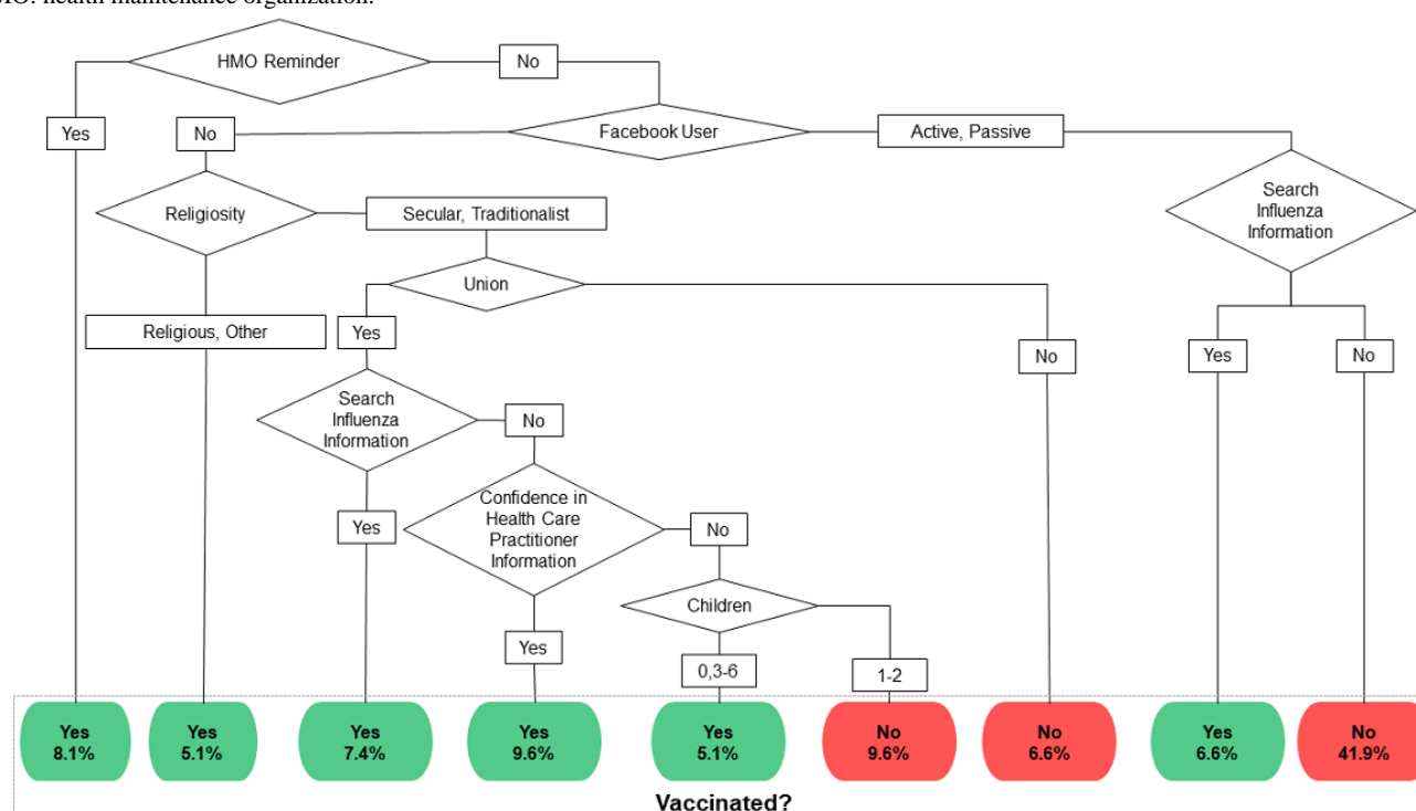
Figure 3. Decision tree predicting vaccinated individuals based on all survey attributes with P \leq .10 and without the due to another reason attribute. HMO: health maintenance organization.

Not focusing particularly on COVID-19 did not have an impact on classification. This supports our main objective, which was to characterize profiles of vaccination engagement in a simple and generalizable way.