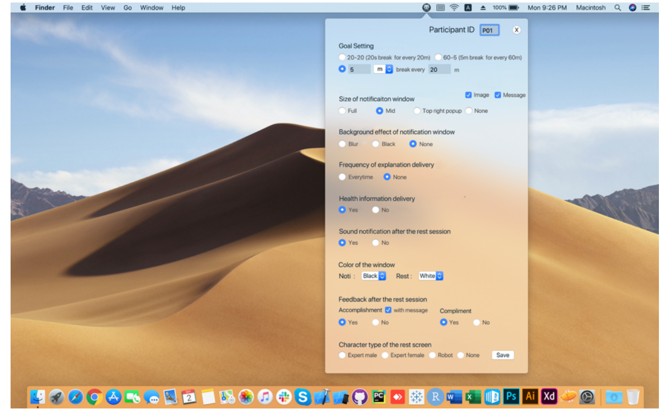
Figure 2. Example scenarios of LiquidEye. The interface elements (A-F) in the example scenarios are customizable in the settings menu. (A) Notification (B) Instruction page

Figure 1. Settings menu of LiquidEye. In the settings menu, users can customize their interface options for LiquidEye.