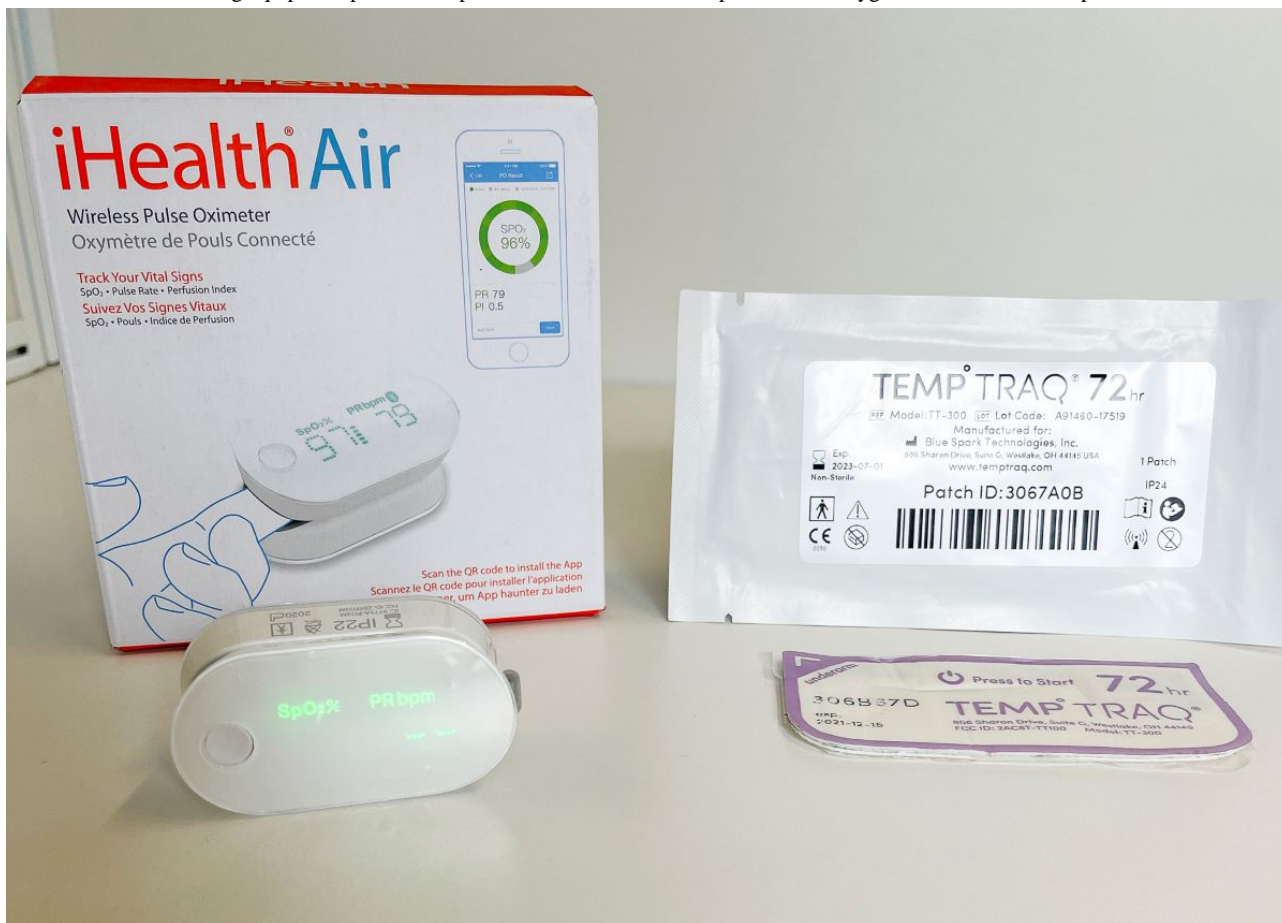
Figure 1. Remote monitoring equipment provided to patients for measurement of pulse, blood oxygen saturation, and temperature.

A wireless pulse oximeter (iHealth Air pulse oximeter PO3M, iHealth Labs, Inc.) facilitated peripheral oxygen saturation and pulse rate measurements. Pulse oximeters were only used by one patient; they were not reused as they could not be adequately disinfected. A single-use, wearable temperature monitor (Temp°Traq Clinical, Blue Spark Technologies, Inc.) was