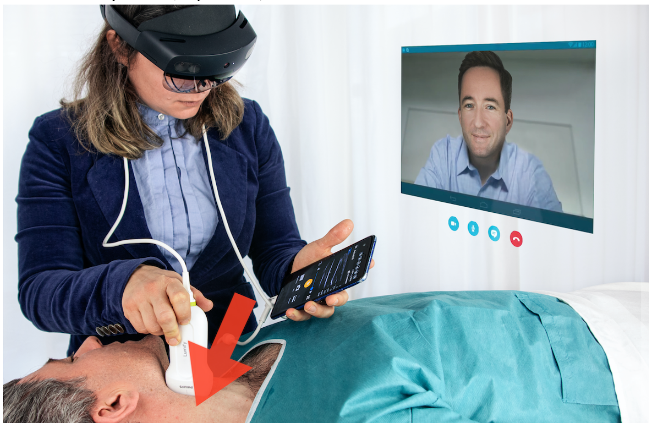
Figure 1. Example of the presented study setting with the investigator wearing the HoloLens 2 (Microsoft Corp) while performing the ultrasound examination with the Lumify transducer (Philips Healthcare).

optional blending of pictures or videos into the vision display—features that could be used for visual instruction about precise ultrasound techniques (eg, location of the transducer) or measurements (eg, intrainterventional communication about designated landmarks) in the current setting. The internet download speed (Mbps) and latency or ping (milliseconds) of the observing experts were recorded. Thereafter, they were asked 5 interview questions: (1) written or oral, regarding their perception of social media in general; (2) the remote connection mode in particular; (3) the potential for AR in exercise science and sports medicine; (4) other future digital areas with an impact on this field; and (5) challenges for digitalization in work-related settings.