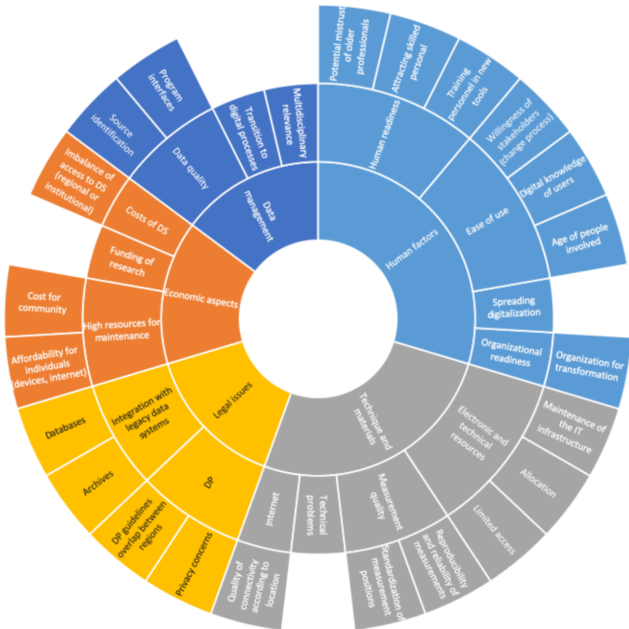
Figure 3. Sunburst diagram showing the areas of challenges for digitalization in work-related settings, as indicated by 8 remote experts. DP: data protection; DS: digital solutions; IT: information technology.