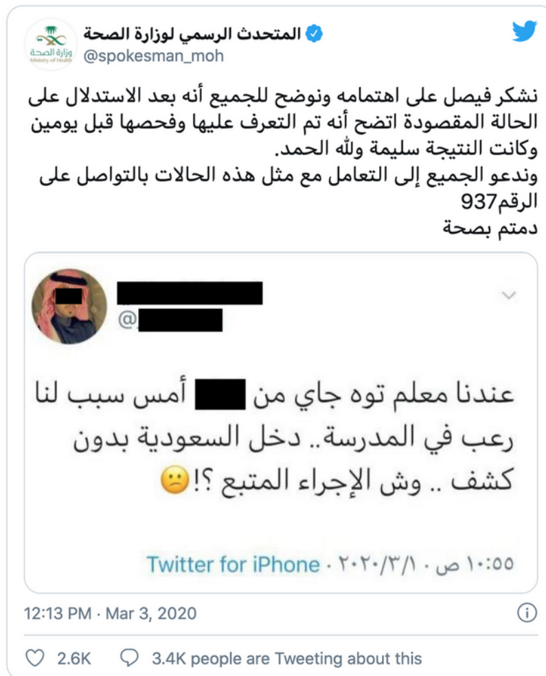
Figure 4. Twitter reply by the Saudi Ministry of Health spokesperson to a tweet by a person who was concerned about a colleague who showed symptoms of respiratory illness after returning from Iran [62].

The MOH has also collaborated with other government and nongovernment health entities to establish the Prevention Ambassador Initiative. The initiative is a web-based course for the layperson that provides certification in baseline information on COVID-19 to help prevent and control the COVID-19 infodemic [63]. Another effort to contain internet rumors and misinformation is a Saudi Public Prosecution release stating that intentional spread of rumors about COVID-19 or sharing material that causes panic among the public is an electronic crime that can be punished with up to 5 years of imprisonment or a fine of SR 3 million (US $799,888.20) [64].