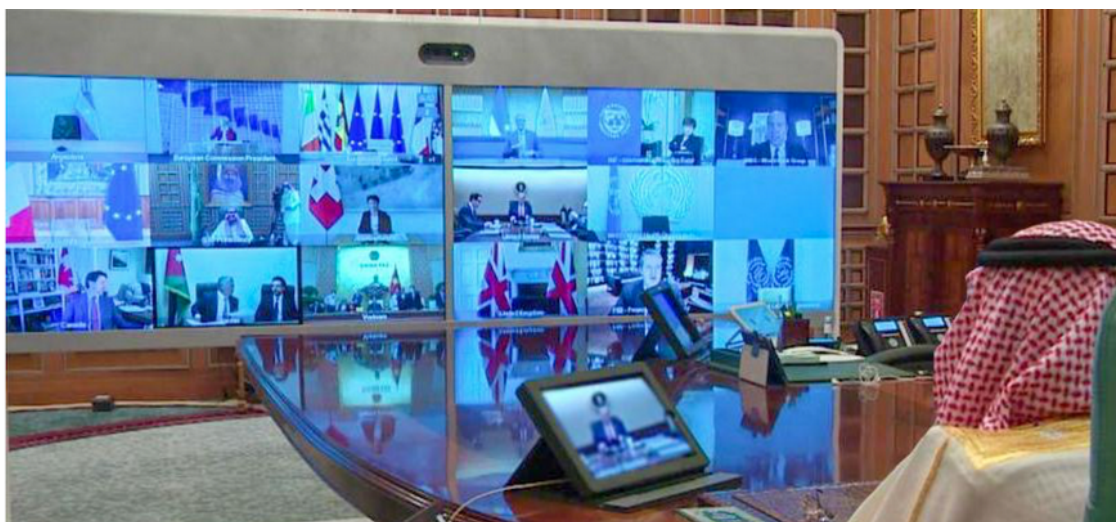
Figure 3. Snapshot of the G20 Extraordinary Virtual Leaders’ Summit on COVID-19, hosted by the Saudi King Salman Bin Abdulaziz, on March 26, 2020.

The G20 International Economic Leaders’ Summit, scheduled in March 2020 and hosted by Saudi Arabia, was required to “go digital” in light of the COVID-19 pandemic. The summit hosted 19 countries, the European Union, and the Central Bank Governors. Saudi Arabia initiated the G20 Extraordinary Virtual Leaders’ Summit on COVID-19 using videoconferencing that was inclusive of all international delegates. It is worth mentioning that the platform used was built and coordinated by the SDAIA (Figure 3) [51,52].