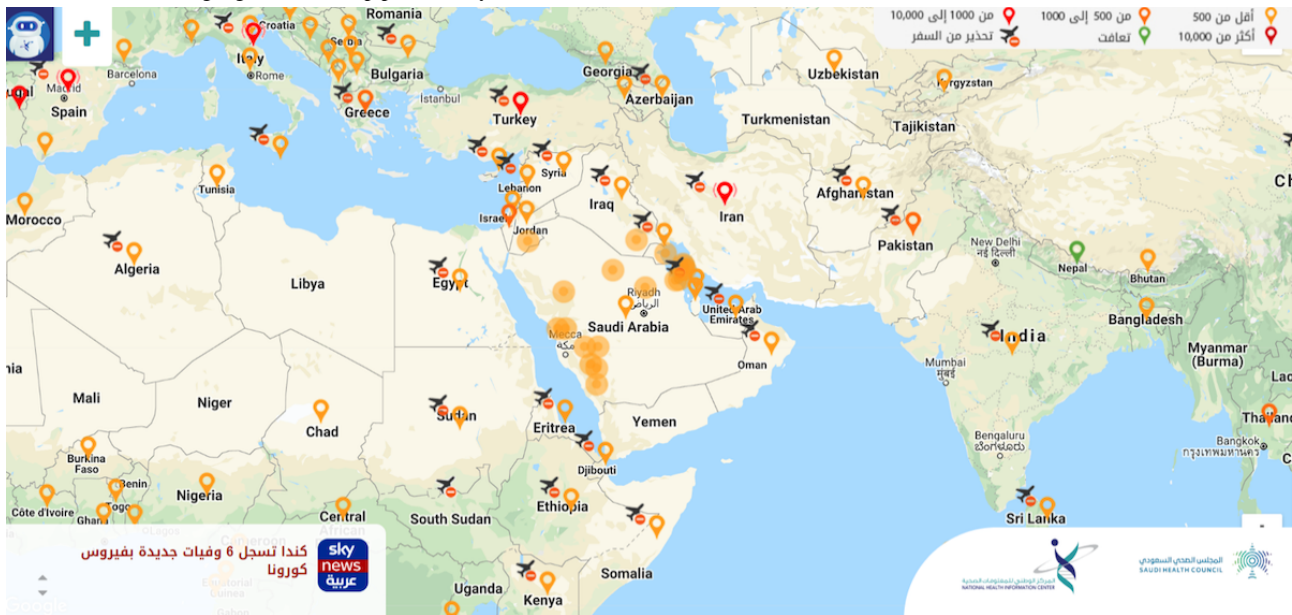
Figure 5. The Arabic language Corona Map provided by the National Health Information Center, under the Saudi Health Council.

As more cases were discovered, the National Centre for Disease Prevention and Control (NCDC), also known as Weqaya, launched the COVID-19 hub website, followed by the Ministry of Health’s COVID-19 awareness website [68]. Here, Arabic guidelines and essential information could be found under broad audience categories: community and public, professionals and health care workers, and daily updates [69]. A month into COVID-19 containment measures, the Ministry of Health released a public link to its live local Arabic dashboard, COVID-19 Dashboard: Saudi Arabia [69]. Accessibility to credible facts in a timely manner are core WHO principles of risk communication [60].