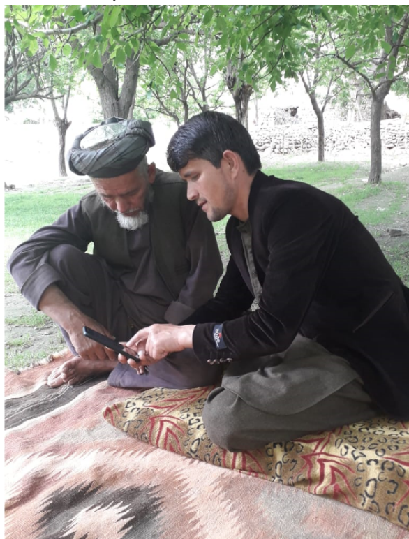
Figure 3. Awareness content being shown to the community.