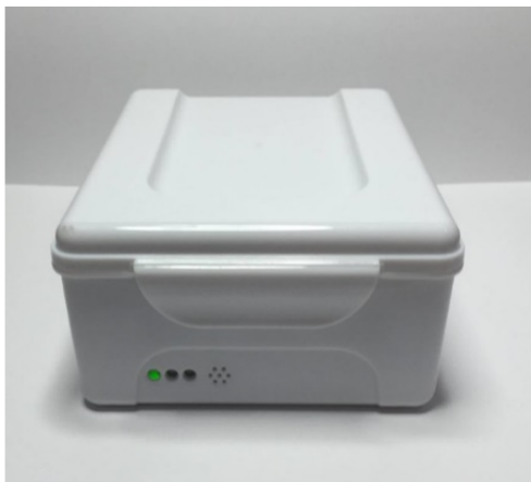
Figure 1. The evriMED real-time adherence monitor.

criteria for all participants were aged over 18 years and engagement in HIV care through one of the above-defined roles. Additionally, ART clients had to have HIV infection per clinic records and own a cellular phone (familiarity with cellular technology was felt important to inform their input on the intervention). Exclusion criteria for all participants were unwillingness or inability to provide informed consent.