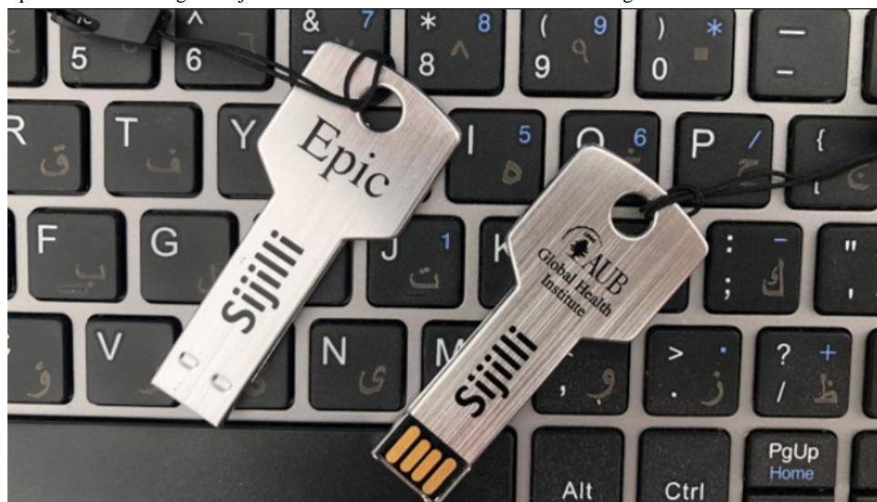
Figure 1. The key-shaped USB containing the Sijilli electronic health record handed to the refugee.