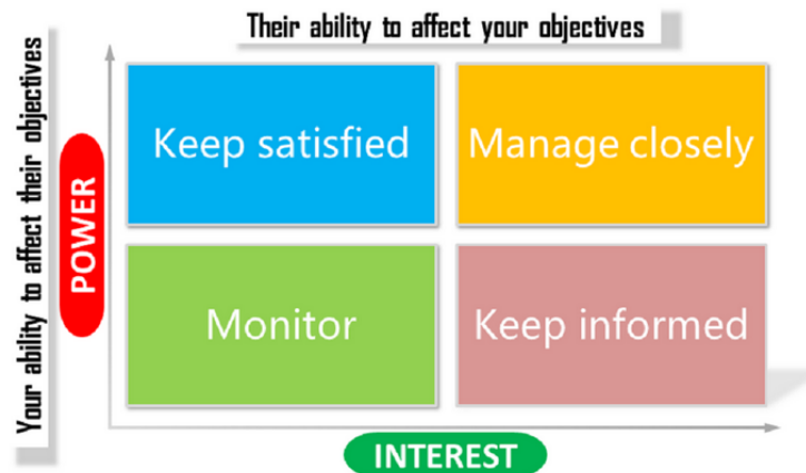
Figure 1. A simple stakeholder management model (adapted from Freeman and Reed [10]).

Stakeholder analysis is often employed to facilitate the formation of strategies, as it can generate knowledge about how the characteristics of stakeholders influence decision-making processes as well as the relevant actors' behaviors, intentions, and interrelations [8]. Courage, creativity, and a capacity to recognize opportunities for change will be key for public health advocates to create political incentives and manage political risks for leaders. Globalization may be helpful for leaders to gain awareness of the necessity of change and innovative strategies in health care [11]. Better insight into how health systems are structured and how they react over time to better adjust to health programs will also affect stakeholder management [12]. Despite considerable research on risk analysis in health politics, only little insight has been gained.