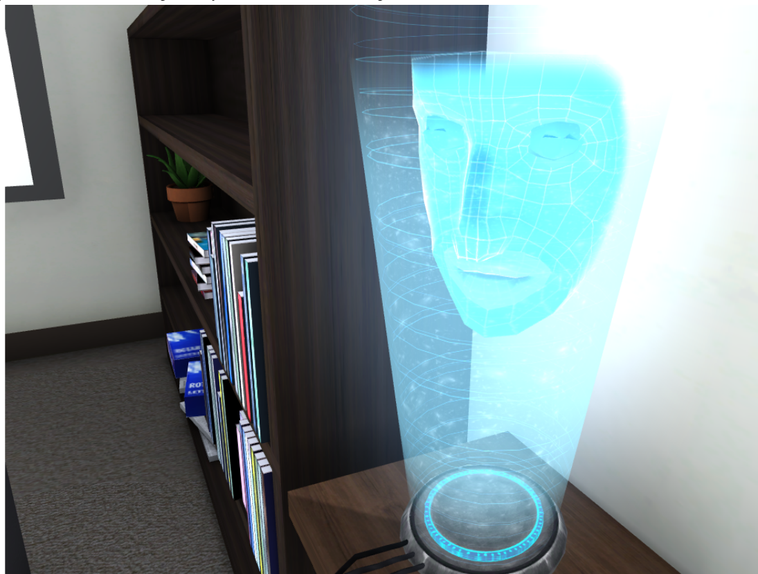
Figure 1. Physical embodiment of the primarily voice-based virtual therapist.

All treatments were conducted in a university laboratory environment at Stockholm University. Participants were provided with inexpensive over-ear headphones and virtual reality devices—Gear VR (Samsung) using Galaxy S6 (Samsung) mobile phones—for use during the treatment. In the first study, the VTAS questionnaire was administered in paper format at the postassessment occasion (ie, 1 week following treatment). In the second study, the VTAS was administered along with other questionnaires immediately after treatment via an online survey. Outcome follow-ups were administered at 3 months in the first study and at 6 months in the second study. Outcome data were collected using an online tool [41] for all follow-up in the second study and for follow-up in the first study only if a participant was unavailable to meet in person.