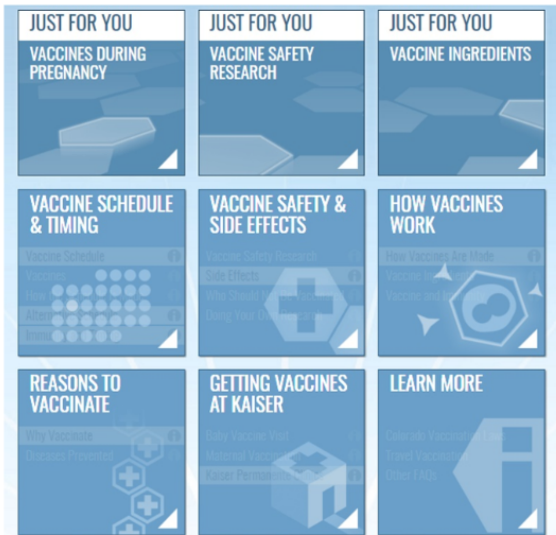
Figure 3. Architecture of the Final Tailored Intervention - Vaccines and Your Baby Home Page.

about their concern. In the message framing interviews, 4 mothers were presented with up to 9 messages, which addressed as many as three featured concerns in the Just for You tiles. These messages included up to three messages tailored to value domains and up to three messages with different framing options (ie, a 3 × 3 factorial design; see Table 1 for examples of values tailoring messages). After viewing all the messages for an area of concern, mothers ranked the messages in order of their preferences and described their reasoning around their rankings. When a mother’s top choices aligned with their measured values, we considered the message a candidate for the final intervention. When mothers’ measured values and top ranked messages conflicted, we revised the messages to better align with the reasons that the mothers provided in the message framing interviews. Revised messages were further tested in subsequent interviews using the same interview format but with 3 different mothers.