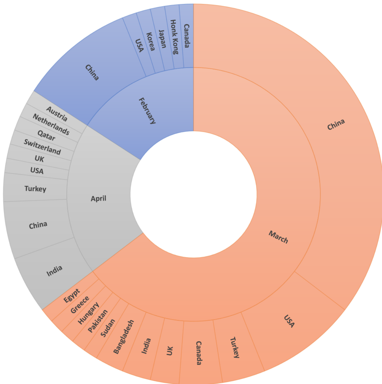
Figure 2. Publications by months and country.