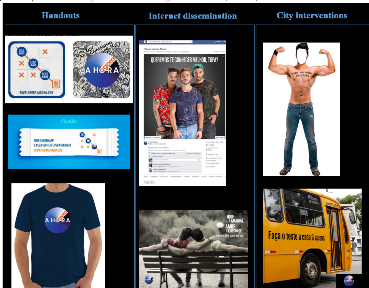
Figure 1. Sample of the “A Hora é Agora” communications strategy for Curitiba, Brazil (2015-2016).