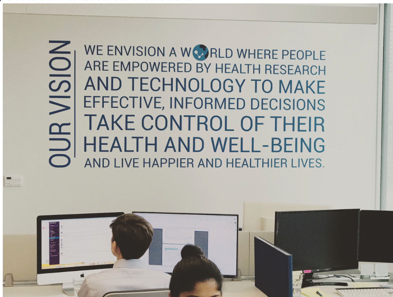
Figure 1. Vision of JMIR Publications at the wall of the editorial office.