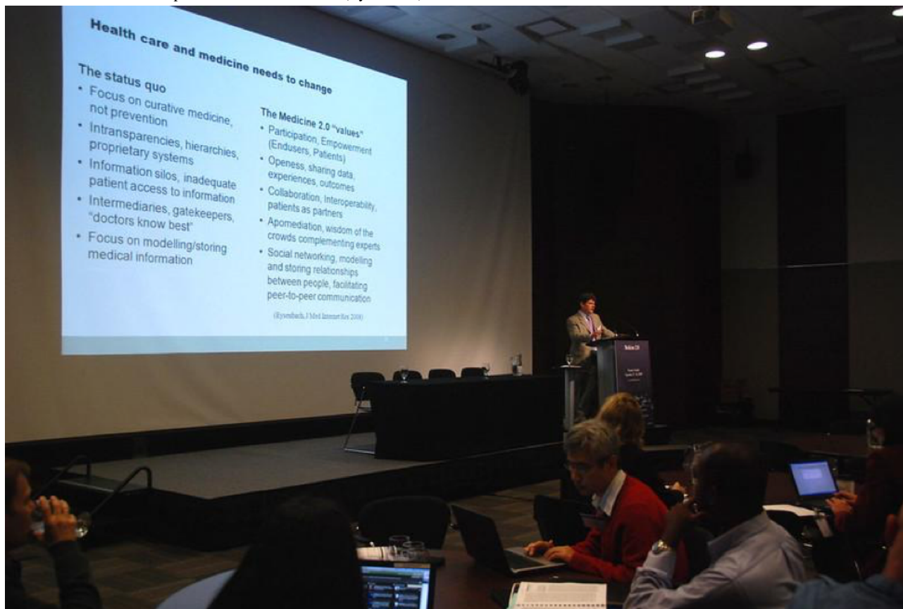
Figure 1. Current health care problems vs Medicine 2.0 (Eysenbach).

In social networking, what we are trying to do is storing and modeling relationships between people, and that adds an entirely