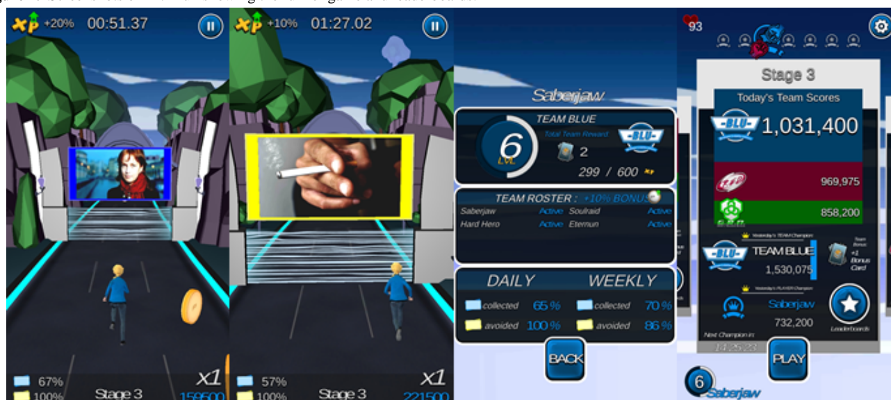
Figure 1. Screenshots of HitnRun showing the runner game and leaderboards.

RCTs to test the efficacy of this new approach and whether the specific design elements mediate efficacy are underway. We do not have these data yet. However, our main aim of elaborating this example was to provide concrete instantiations of design decisions that would not have otherwise emerged without an empathy-based DT approach.