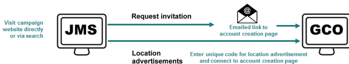
Figure 2. The description of routes to account creation on GetCheckedOnline.com (GCO) during the JustMakesSense (JMS) campaign; visitors to the JMS main website.

GCO. Visitors without a code could request an email invitation; visitors were not asked whether or where they had seen the campaign (Figure 2). In addition, we used 2 types of Web-based promotional venues—advertising in a lesbian, gay, bisexual and transgender news website , and advertising on geosocial websites and apps used by GBMSM to find sex partners (Grindr, Jack’d, Manhunt, Squirt, and Scruff). To track testing outcomes for each Web-based venue, each post or ad contained a link to a unique, alternate copy of the JMS website. From each alternate site, visitors proceeded to the GCO account creation page by clicking a link containing an embedded access code unique to each Web-based venue, which could then be associated with each account created.