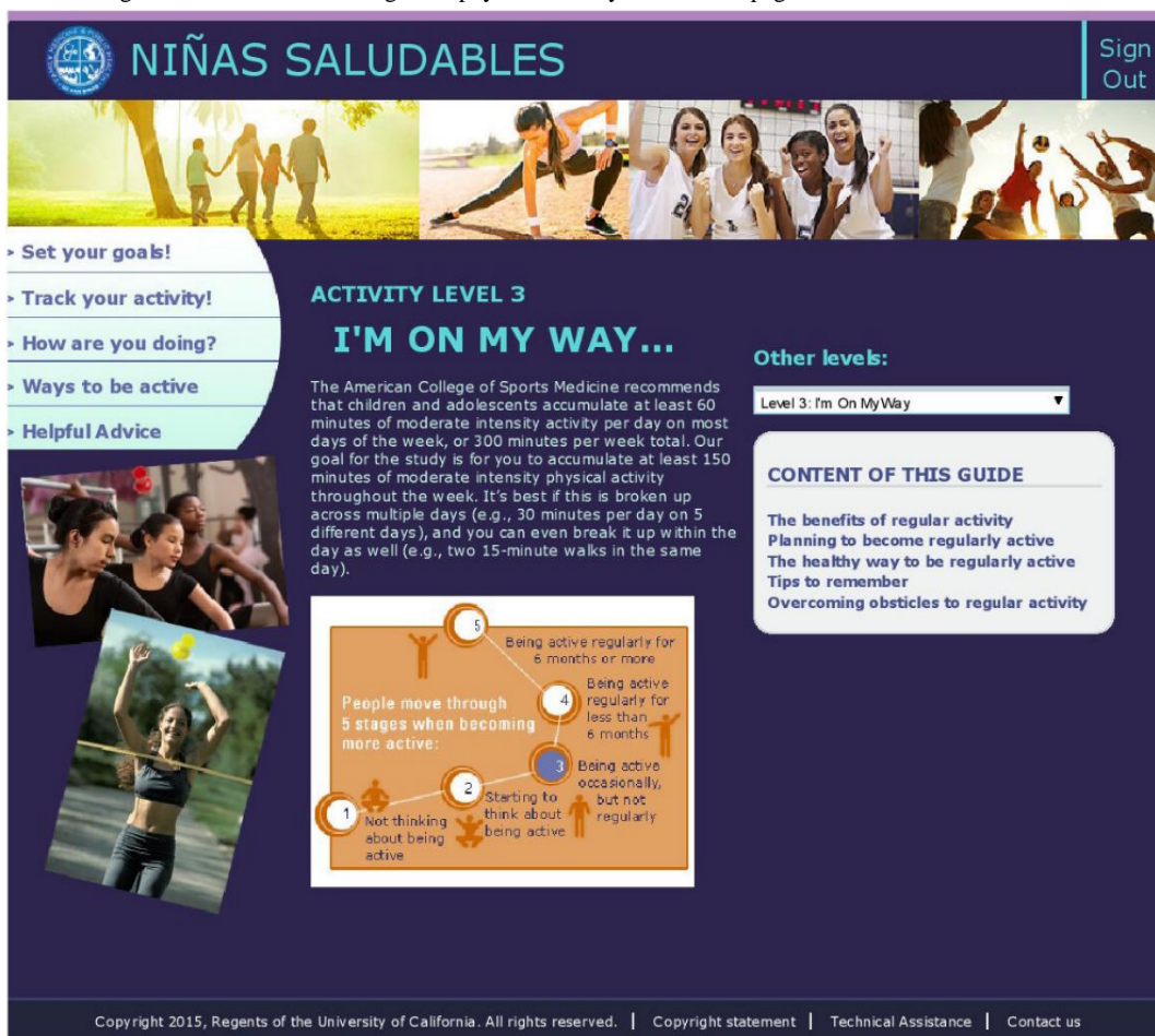
Figure 1. Screenshot of stage-matched moderate to vigorous physical activity information page.

Participants completed monthly questionnaires on the website (see the section Measures) that generated individually tailored content: (1) stage-matched webpages provided information about MVPA that was matched to the participant's level of readiness, or stage of change, for becoming more physically active, according to the Transtheoretical Model and Social Cognitive Theory (see Figure 1), and (2) personalized computer expert system reports. The expert system draws from a bank of 330 messages addressing psychosocial and environmental factors influencing MVPA and automatically generates personalized reports on (1) their current stage of motivational readiness for physical activity; (2) increasing self-efficacy for physical activity; (3) cognitive and behavioral strategies associated with physical activity behavior change (processes of change); (4) how the participant's answers compared with their prior responses (progress feedback); (5) how the participant's responses compared with other adolescents who are physically active (normative feedback); and (6) self-monitoring of physical activity behavior (using online activity logging calendars). This expert system has been used in multiple intervention studies, and targeted theoretical constructs were shown to mediate changes in physical activity [20,21].