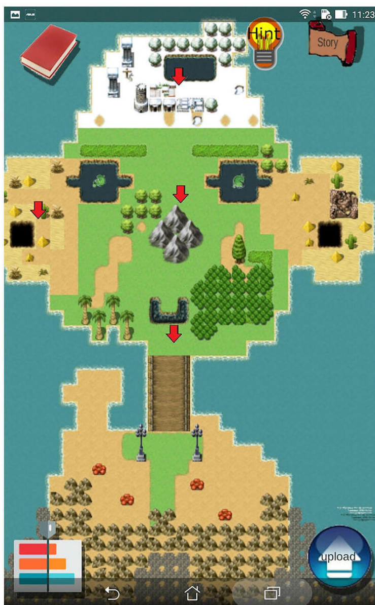
Figure 2. Start of the apps. Learners read the adventure story and objectives (story symbol), played four instructional domains (red arrow symbol), reviewed instructional materials (book symbol), assessed learning progress (bar chart symbol), and got the helps (hint symbol) on the start screen.

A total of 60 consecutive volunteers were recruited from a teaching clinic for the validation study from November 23, 2016 to July 5, 2017. All of the volunteers had at least a basic level of computer literacy, and they were shown the practical aspects of using tablets and apps. The inclusion criteria were as follows: (1) age >20 years; and (2) undergraduate medical students (clerkship). The exclusion criteria were: (1) previous ORL-HNS training; and (2) declining to participate.