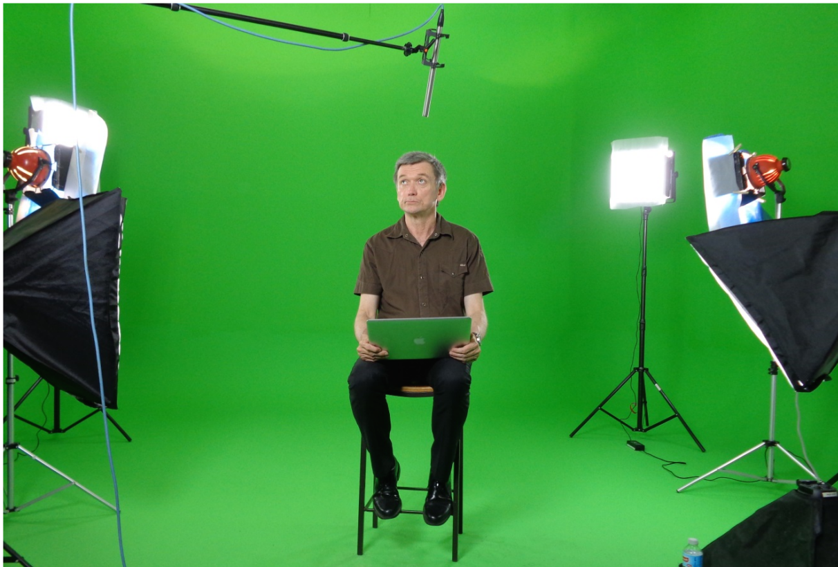
Figure 2. Filming of the Vancomycin Interactive (VI).