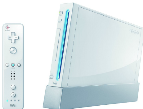
Figure 2. Nintendo Wii controller (left) and Nintendo Wii base console (right).