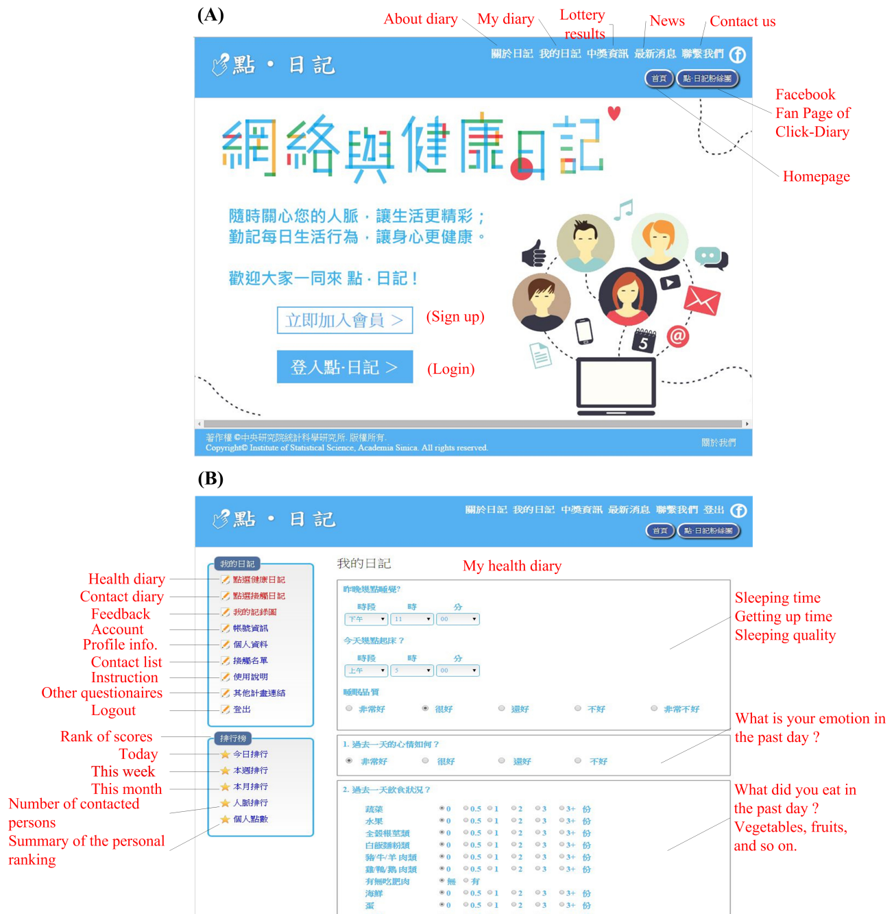
Figure 1. Screenshots of ClickDiary. (A) Home page; (B) The interface of the health diary.