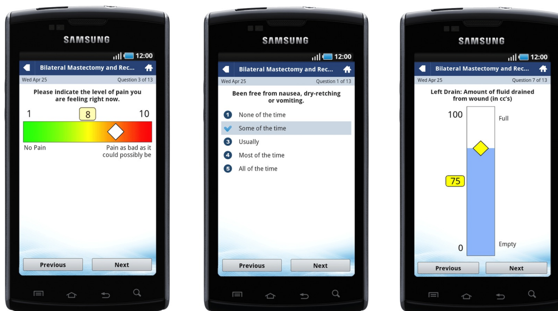
Figure 1. The mobile app user interface.