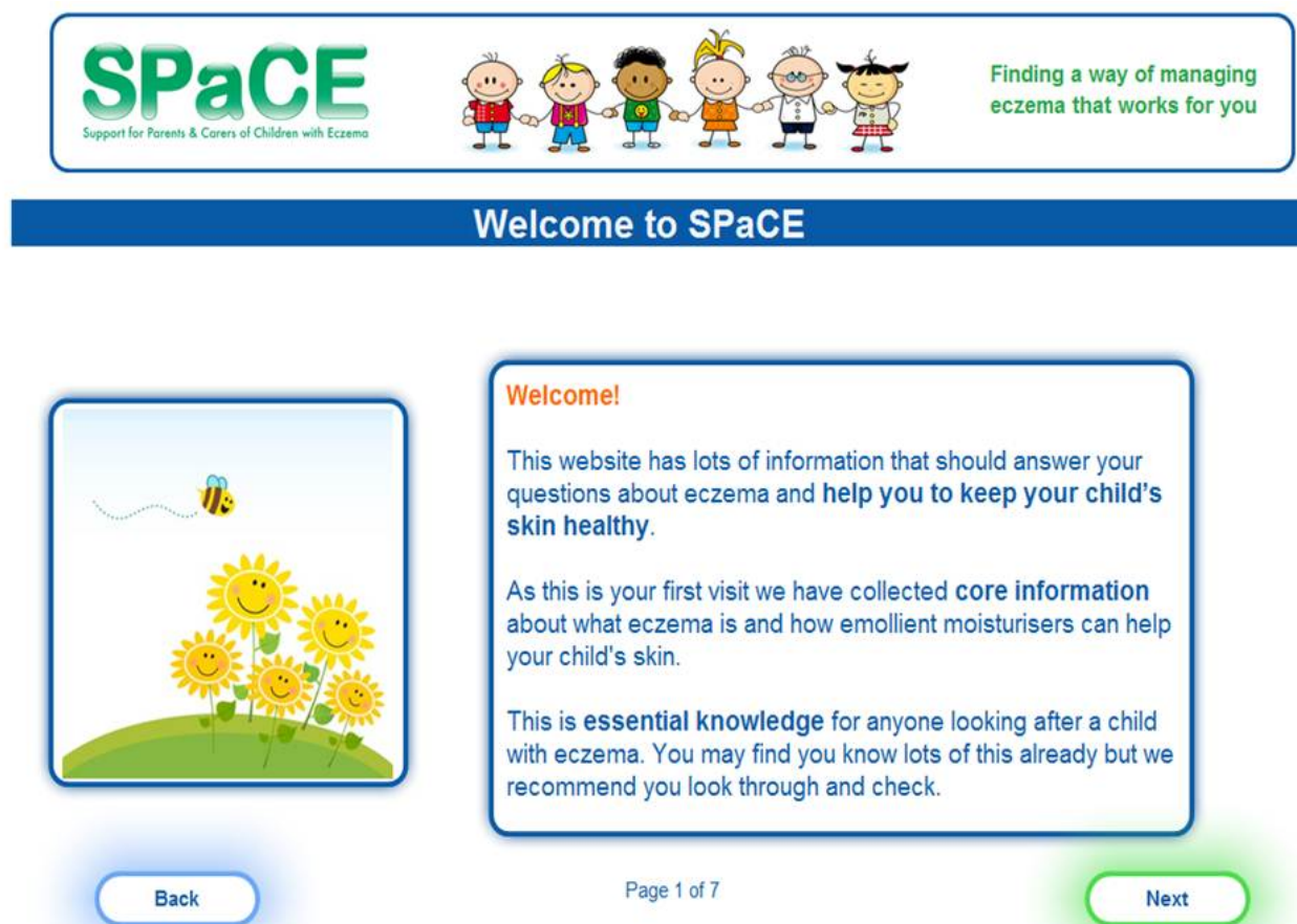
Figure 1. Screenshot of SPaCE website welcome page.