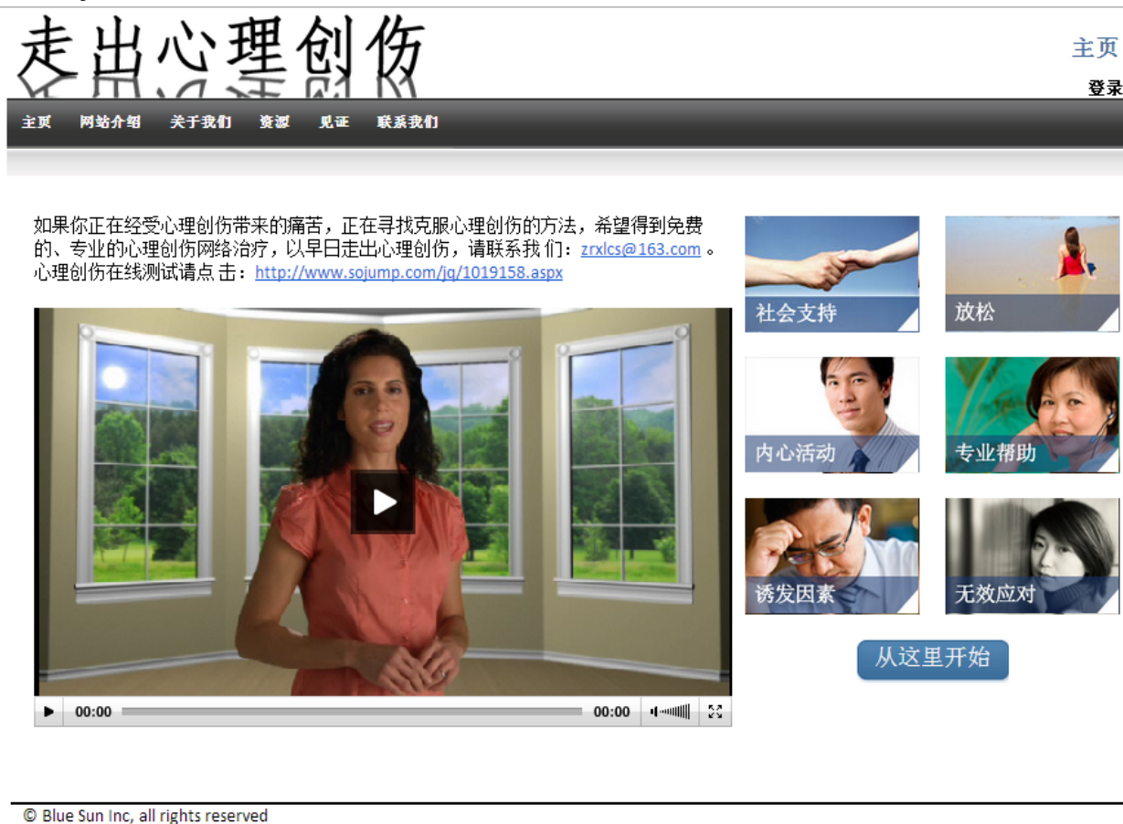
Figure 1. Example screenshot of the CMTR website.