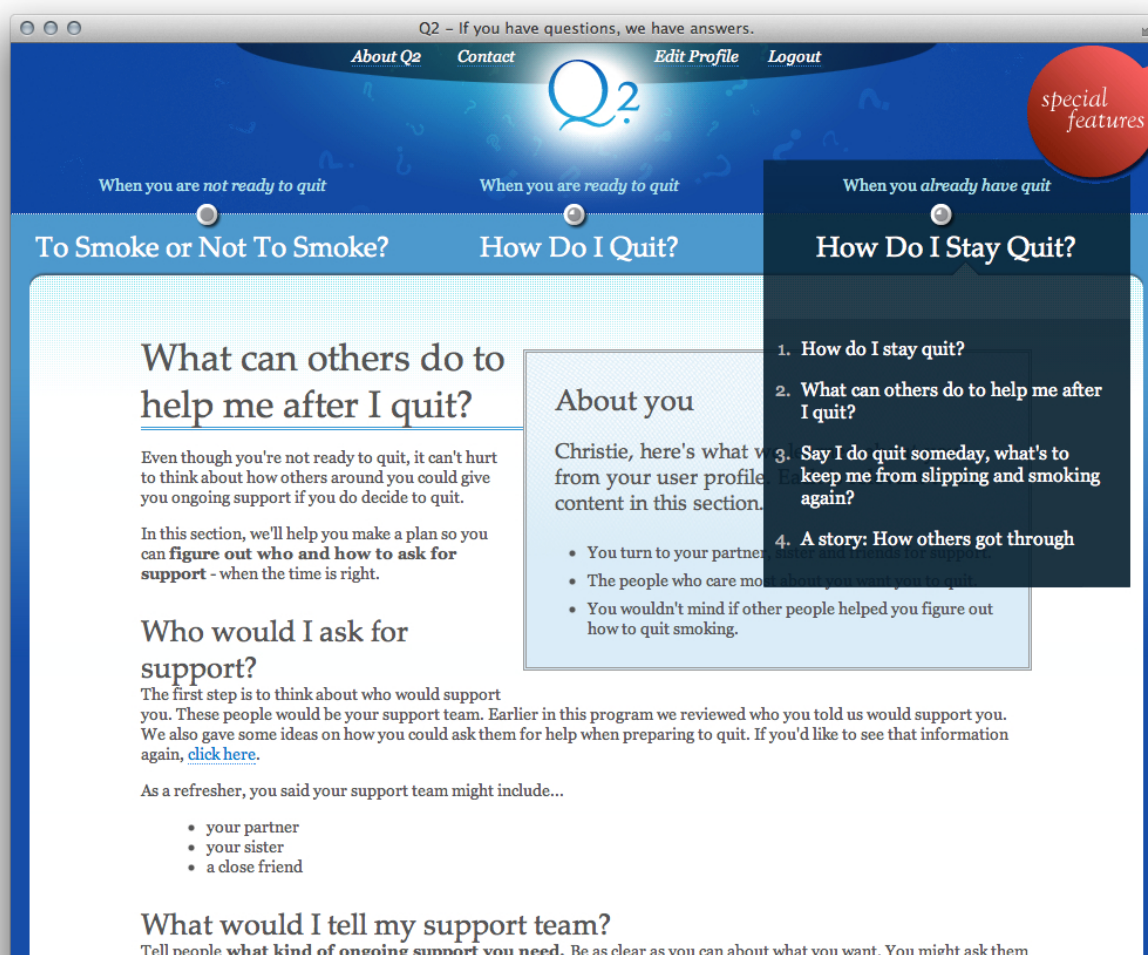
Figure 1. Example screenshot of Questions about Quitting (Q2) layout.

Participants could view the Q2 program as often as they liked and they were encouraged to return to the website in the future. Upon return, if more than 24 hours had elapsed since their last visit, participants were asked to restate their readiness to quit smoking and the content was retailored to reflect their current smoking status and interest in quitting. The basic intervention layout, number of pages, and substantive core content remained unchanged, but the text was refreshed to reflect the change in participants' current motivation for quitting or smoking status. The intent was to ensure that the program content remained responsive to individuals' current needs.