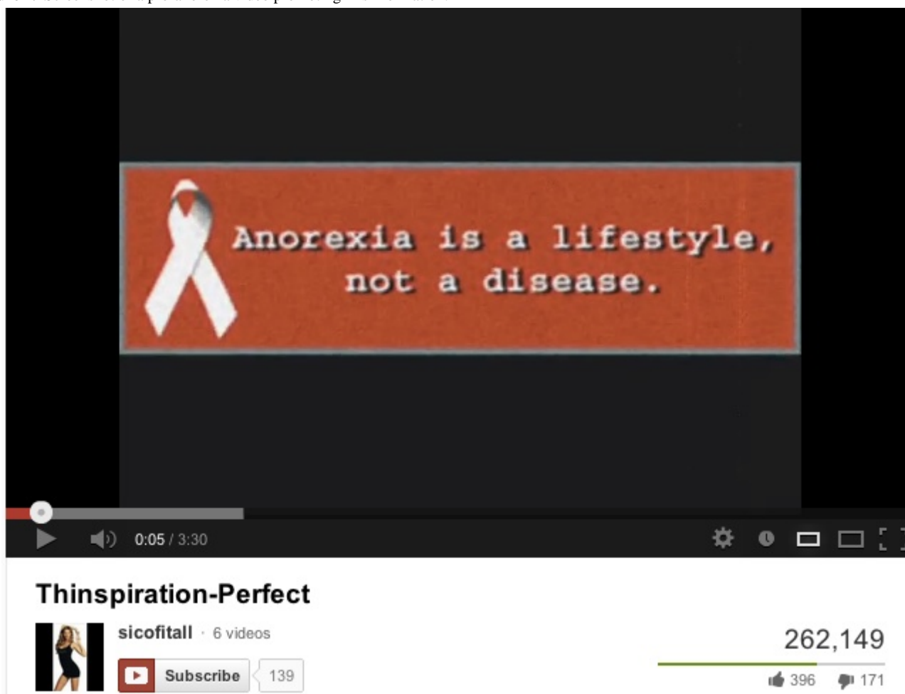
Figure 1. Screenshot of a pro-anorexia video promoting misinformation.