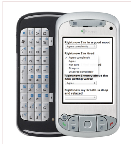
Figure 2. Smartphone screen display of diary.