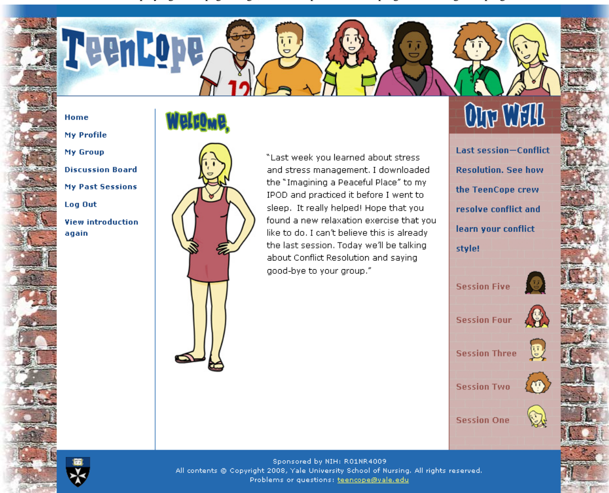
Figure 1. TEENCOPE screenshot displaying home page image, which is updated as teen progresses through the program.

A convenience sample was recruited from 4 university-affiliated clinical sites that included Children’s Hospital of Pennsylvania, Philadelphia, PA; University of Arizona, Tucson, AZ; University of Miami, Miami, FL; and Yale University, New Haven, CT. Inclusion criteria were: youth diagnosed with Type 1 diabetes for at least 6 months, aged 11 to 14 years, with no other significant medical problem, school grade appropriate to age within 1 year, able to speak and write English, and access to high-speed Internet at home, school, community, or clinic.