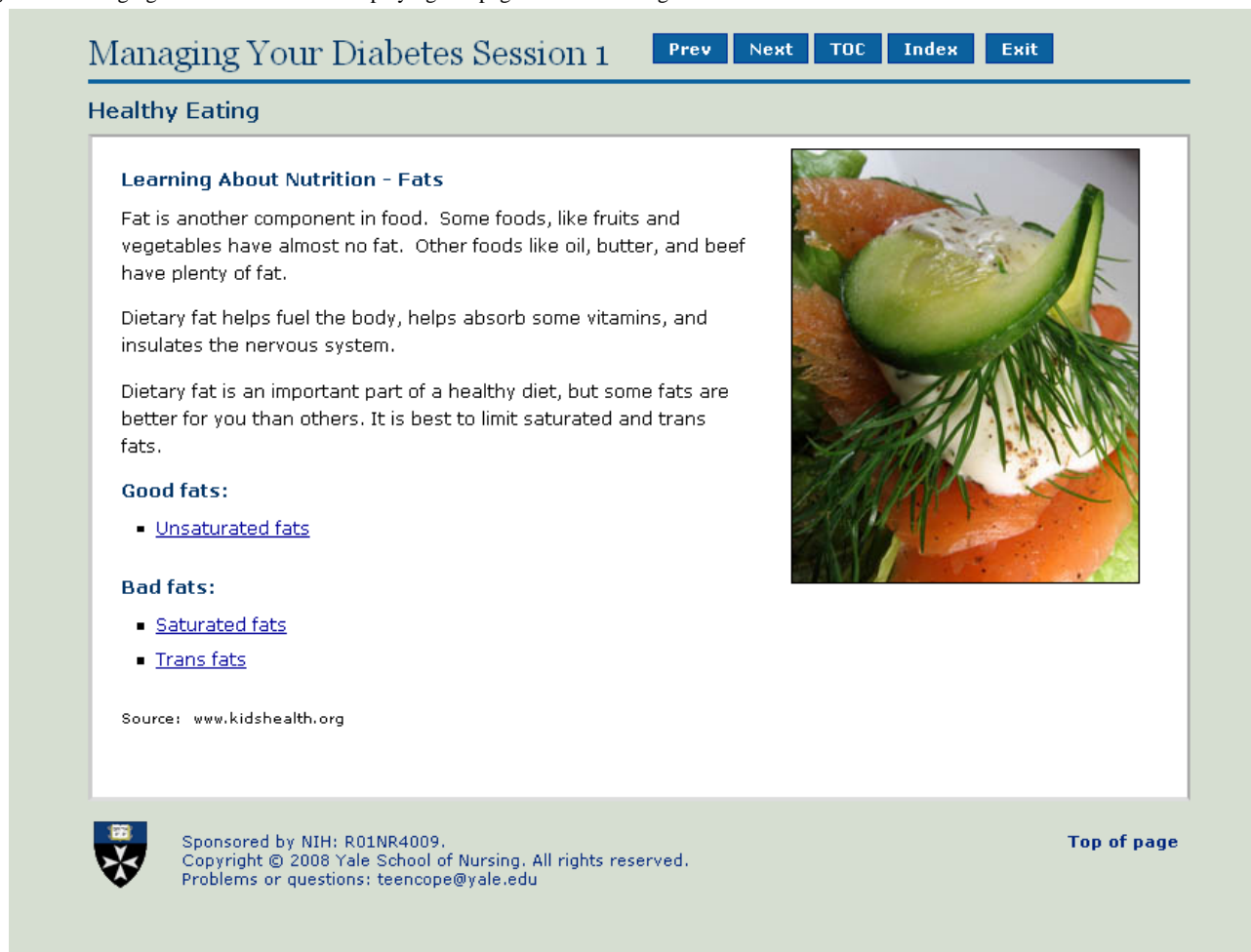
Figure 3. Managing Diabetes screenshot displaying webpage for nutrition segment.