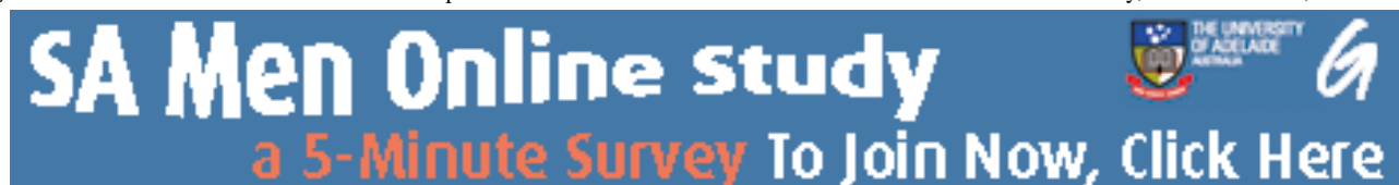
Figure 1. Banner advertisement used to recruit potential men who have sex with men for an online HIV/AIDS survey, South Australia, 2009.

In addition, the study banner was displayed on the ACSA/GMH website. Approximately 800 male members subscribe to an e-news service provided by the ACSA/GMH and they were also invited to participate in the study. In addition, three educators from the ACSA/GMH attached the study banner to their email signature block during the study period.