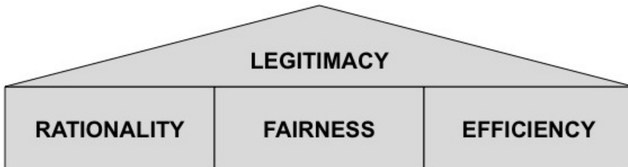
Figure 2. Requirements for legitimate decision making.

of socially accepted techniques and procedures for being legitimate [22]. With respect to the peculiar case of the assessment of telemedicine applications, any recommendation should take into account a multiple-stakeholder perspective. Legitimization by the key stakeholders (ie, health care providers, patient groups, and technology suppliers) is gained when the decision-making exercise is respectful of their views and conforms to their perceptions of what is appropriate. Evidence from previous research suggests that 3 requirements are salient to gain stakeholders’ approval (Figure 2). First, decision making should be rational [23]. Second, decision making should be fair [24]. Third, decision making should be efficient [20]. In the following, we briefly discuss these requirements.