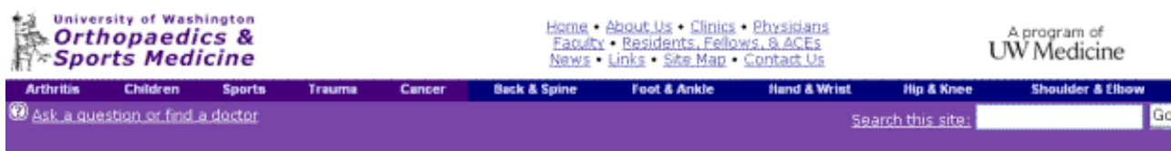
Figure 1. Web site search-box page

IP address, we were able to determine the country of origin of each submission.