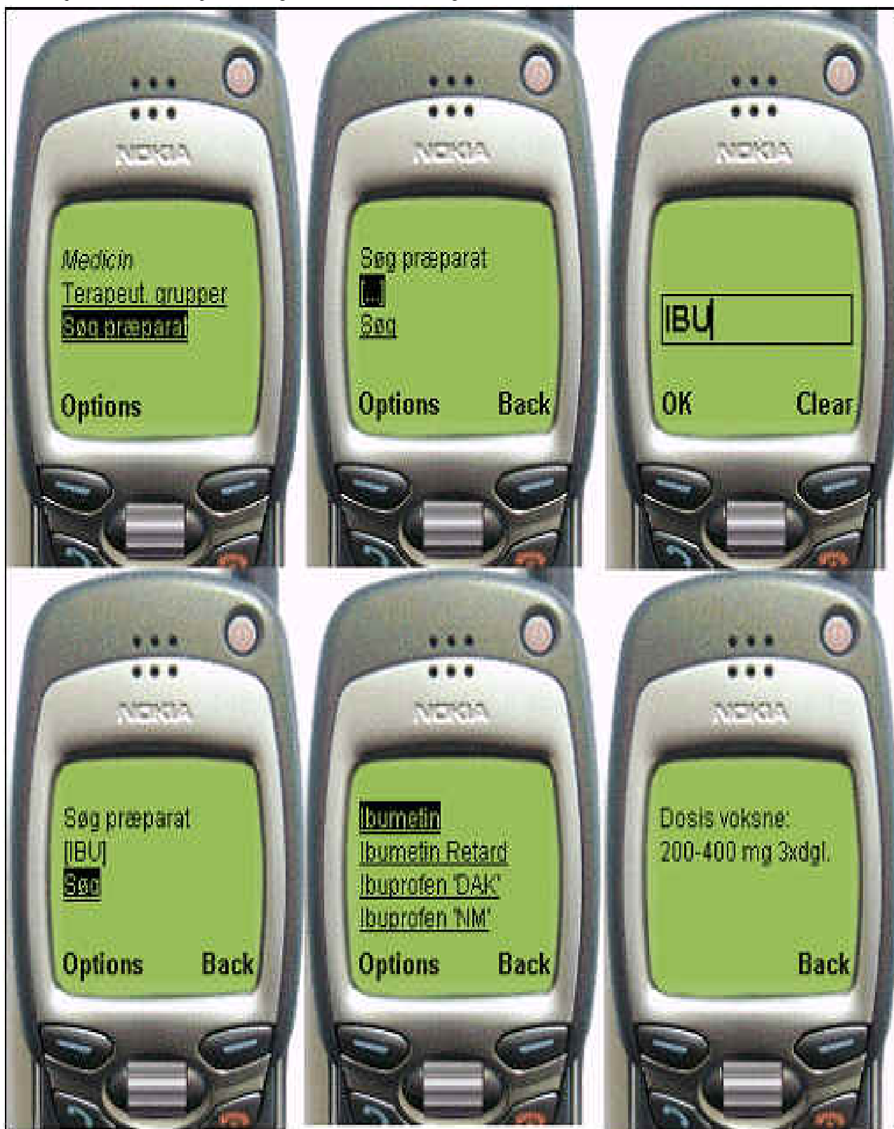
Figure 3. Sequence of screen dumps illustrating the search for of the dosage of Ibumetin on a Nokia 7110. (Søg=search; præparat=brand name; Dosis=dosage; voksne=adults)